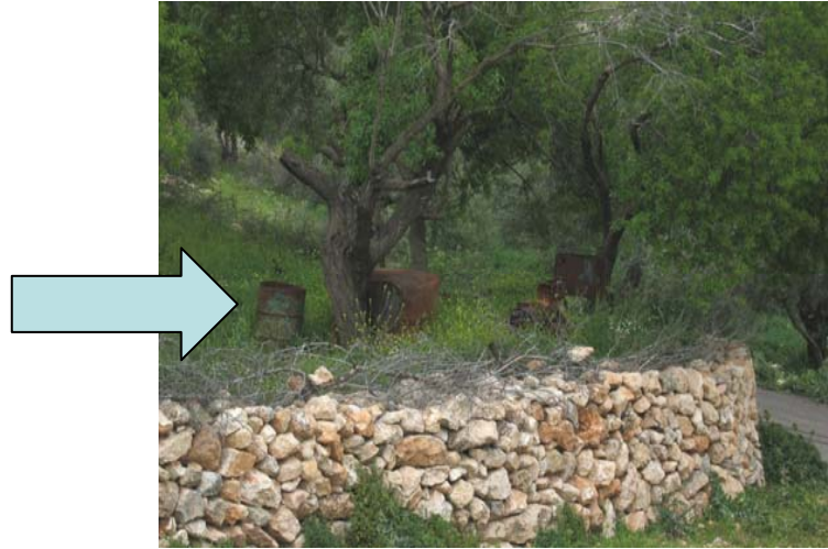
Generator burned by settlers in 2002