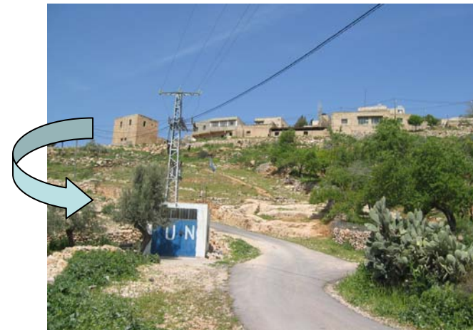
New UN generator