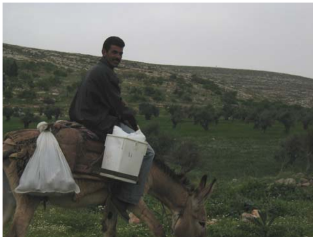
Villager taking homemade cheese and yogurt off to market