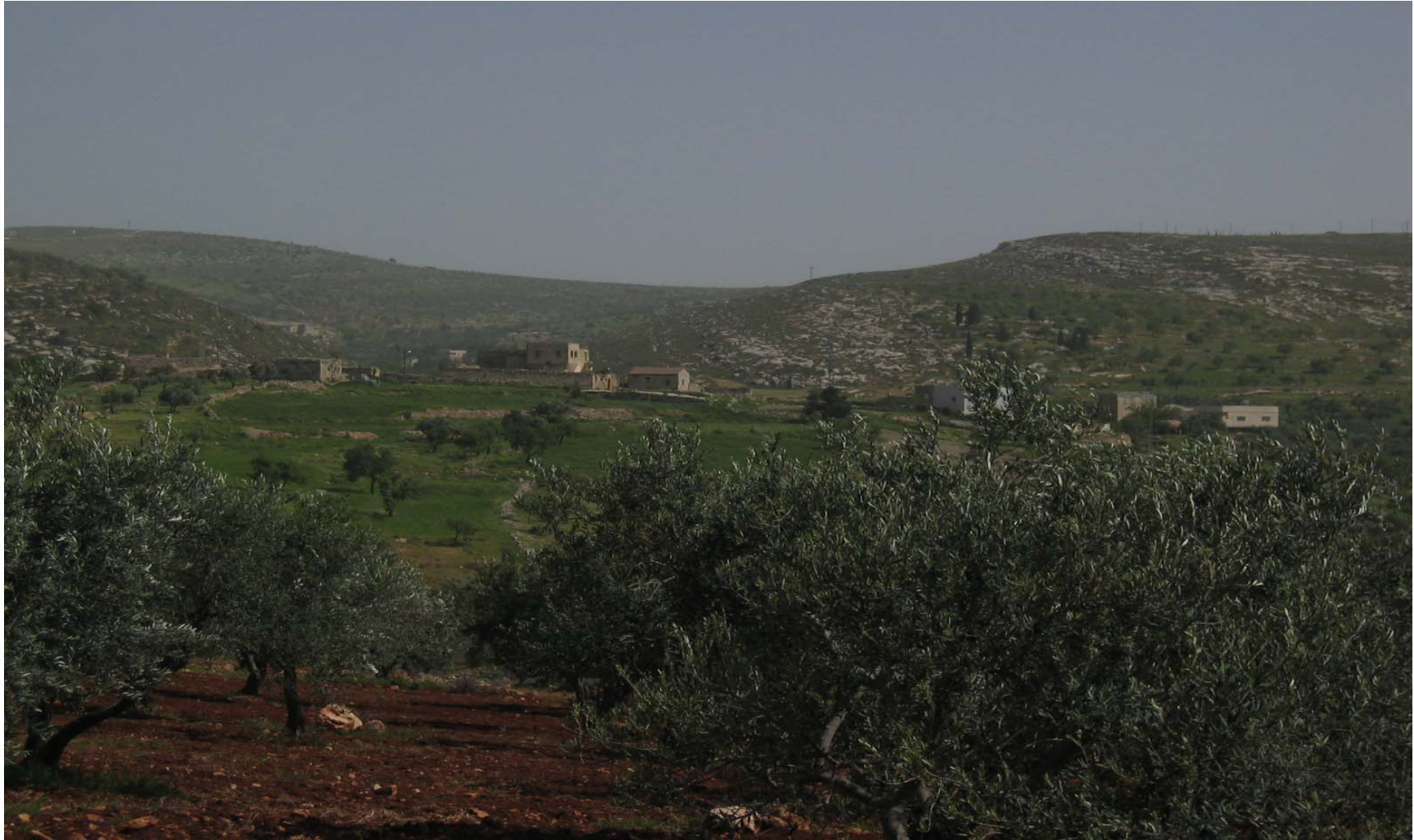
Yanun: a village under siege