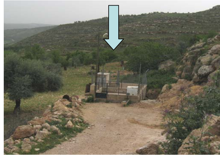
Village well-water from here is used for agriculture as well as domestic needs