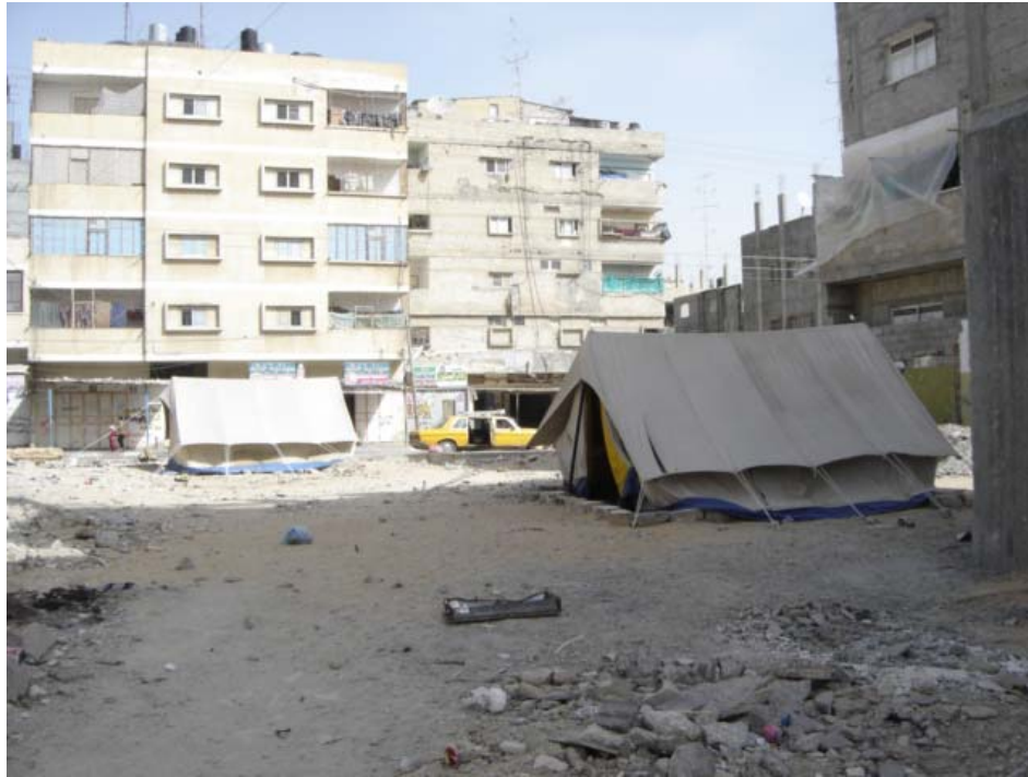
Tents of people whose homes were demolished